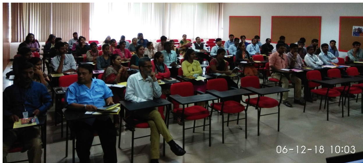
Participants during the first session.